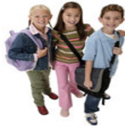
Thank you for caring!

Alone we can do so little, as a team we can do so much!